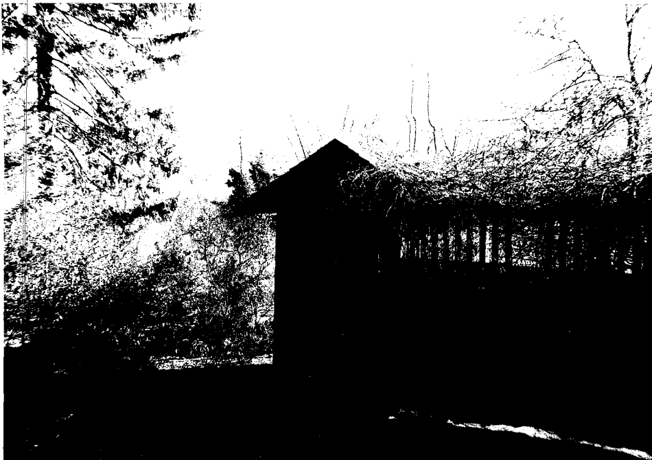
View north 1/1997