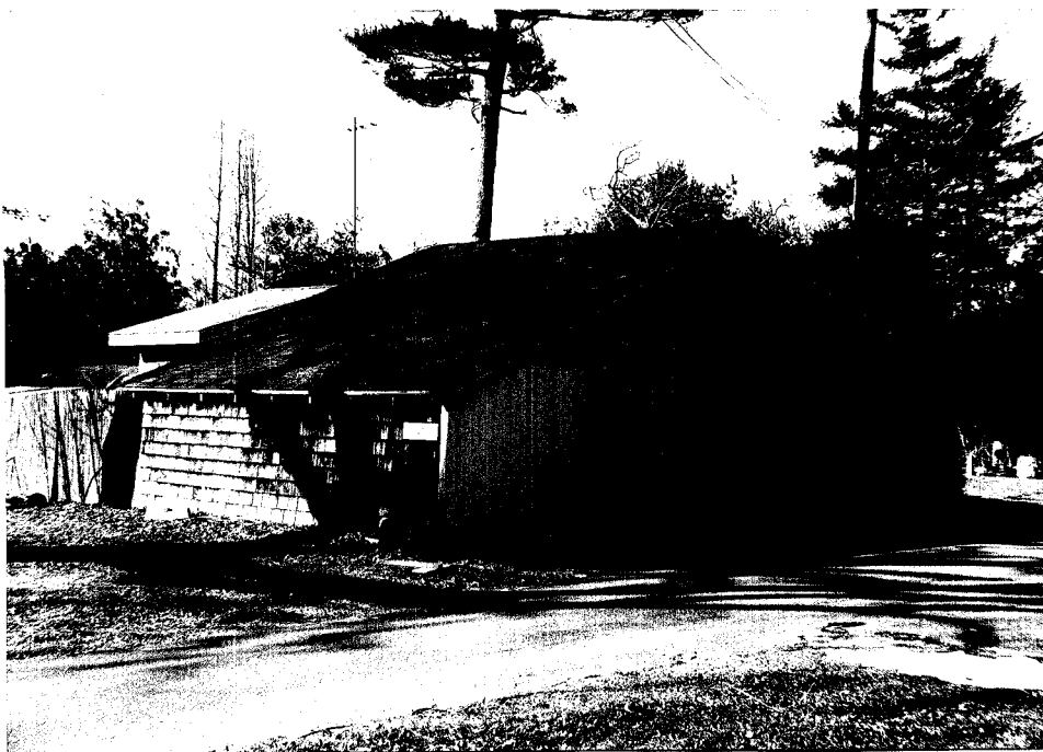
Shed / Garage at Staff Res. III LI-67 (009)