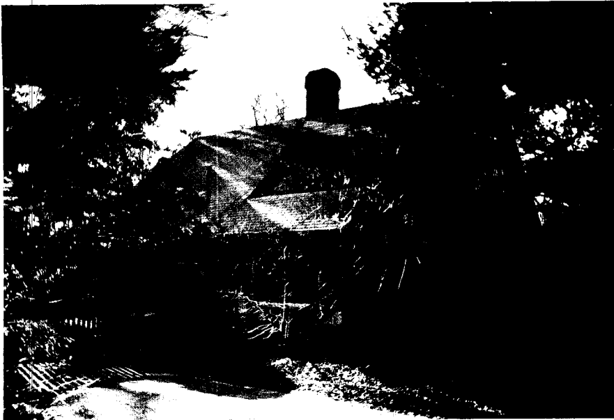
View south-west 1/1997