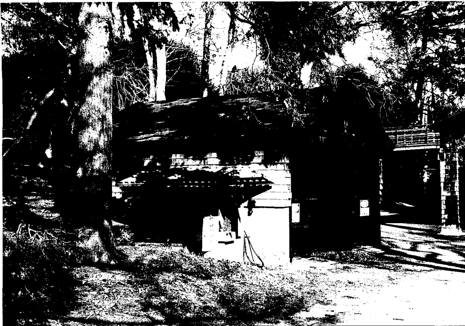
View north-west 1/1997