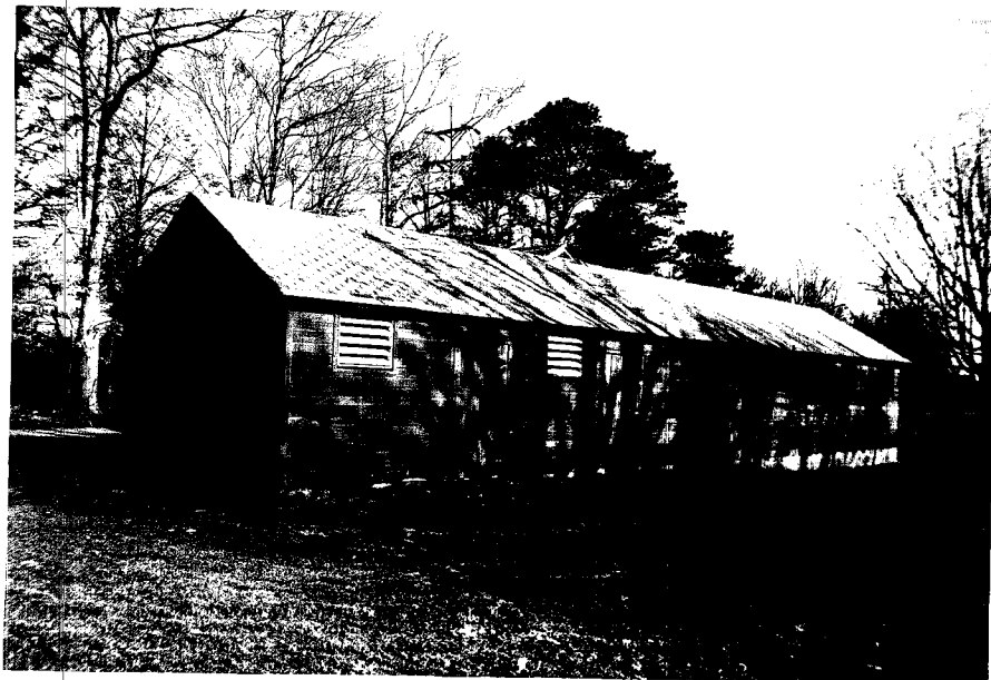
View north-east 1/1997