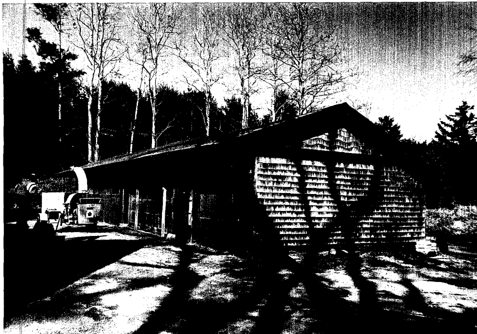
View west 1/1997