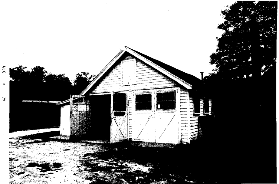
Photo H 17,18,19-21 West facade