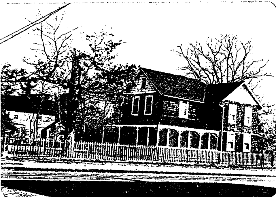
#47 DIVISION STREET