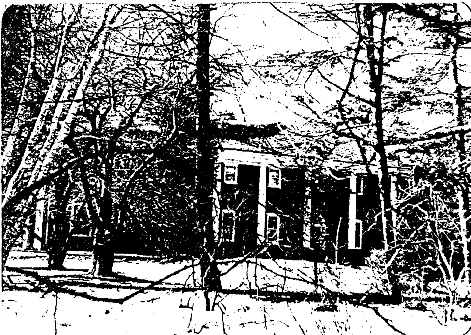
VIEW OF V-14 FRONT FACADE