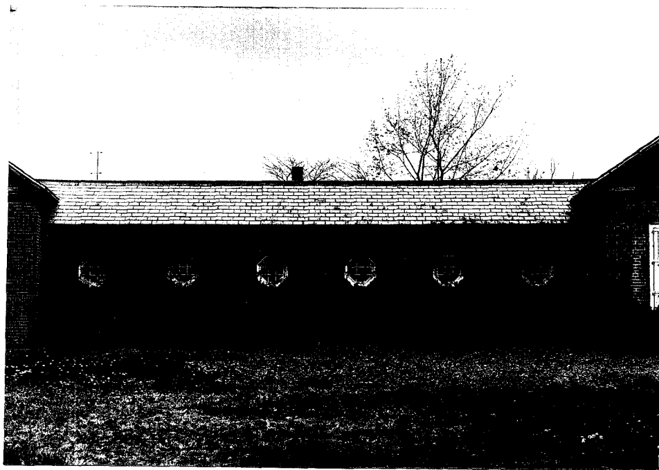
one of the corridors Photo:CI-WHC-r-2,11 from NW