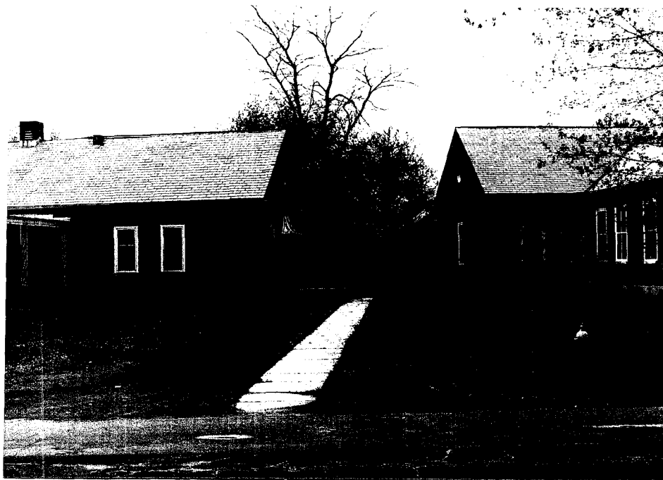
Between Buildings A-4 & A-3