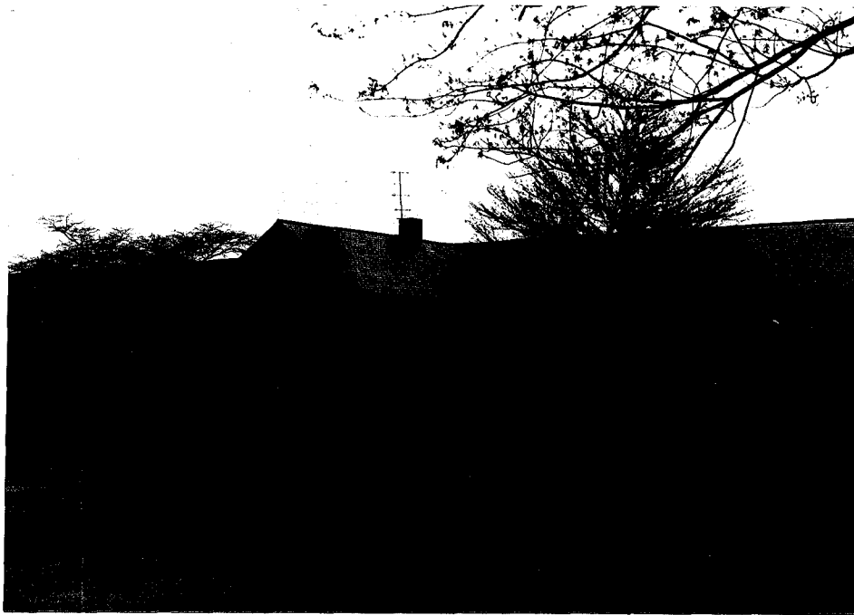
porch side of Building B-6 Photo:CI-WHC-r-2,7 from SW