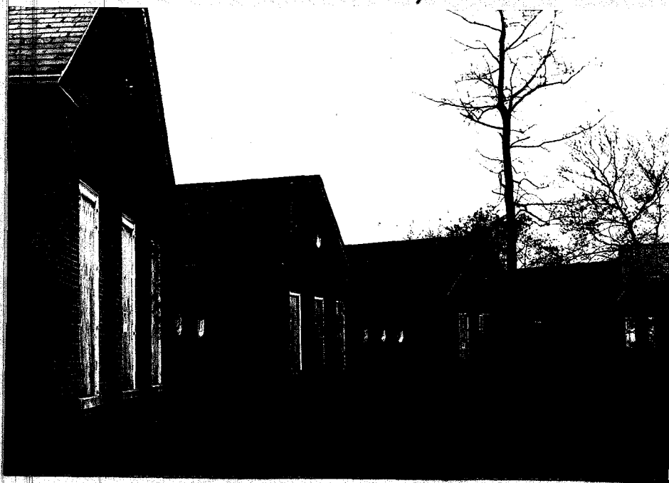
HP-1 fronts of buildings B-1, B-2, B-3, B-4