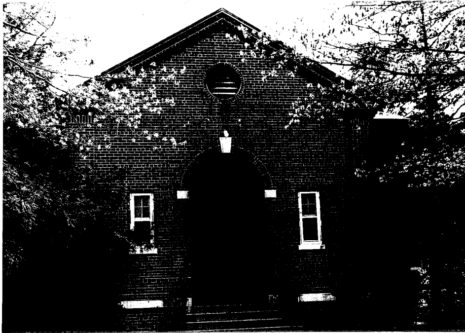
entrance to Building 69 Photo: CI-WHC-r-1,25 from Ne