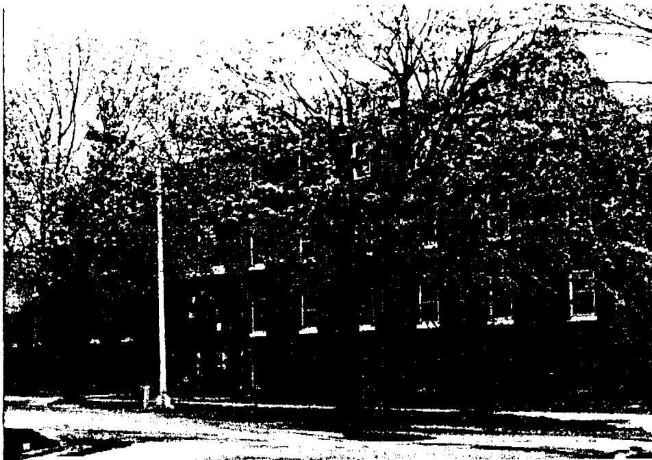
Building 12 Photo: CI-WHC-r-1,20 from NE