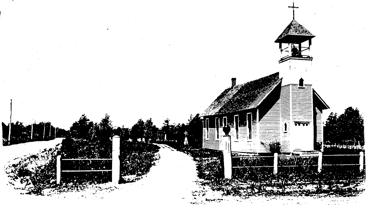
St. John's Church before enlargement and facade renovation.

Korten Photograph, c. 1909, Coll. Nassau County Museum Library.