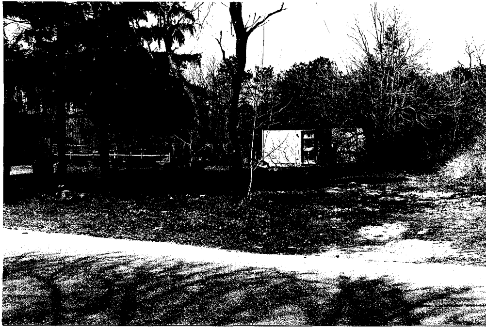
Neg. KK XXI-19, fm. S, showing small wood office east of factory.