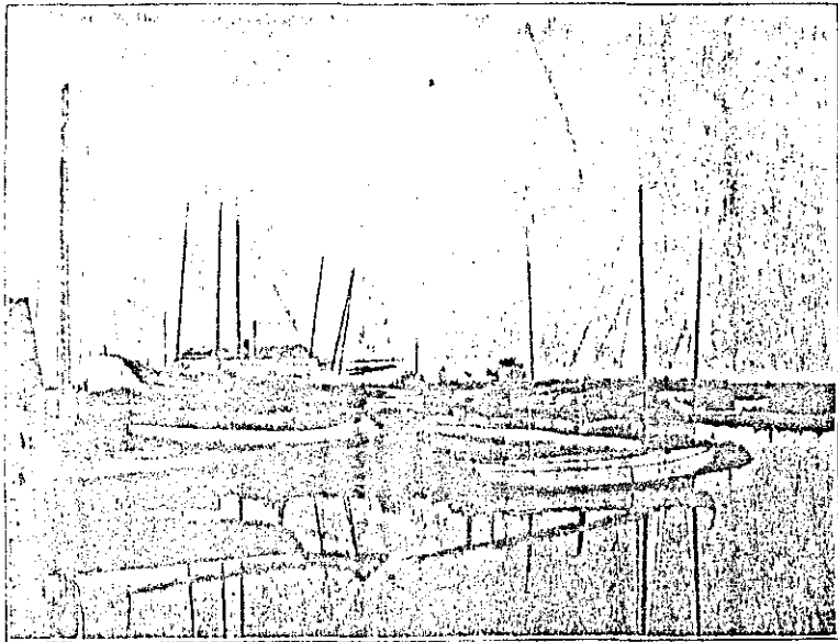
HARBOR AND SHIP YARD, BROWN'S RIVER.