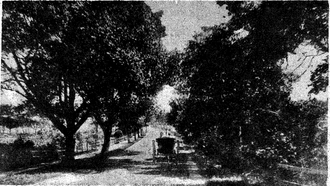
IN THE GOOD OLD SUMMER TIME, long ago. Scene is Main Road in Bayport . Photo was taken in 1912.